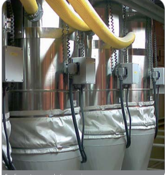
Feeding system on a plastic conveying process