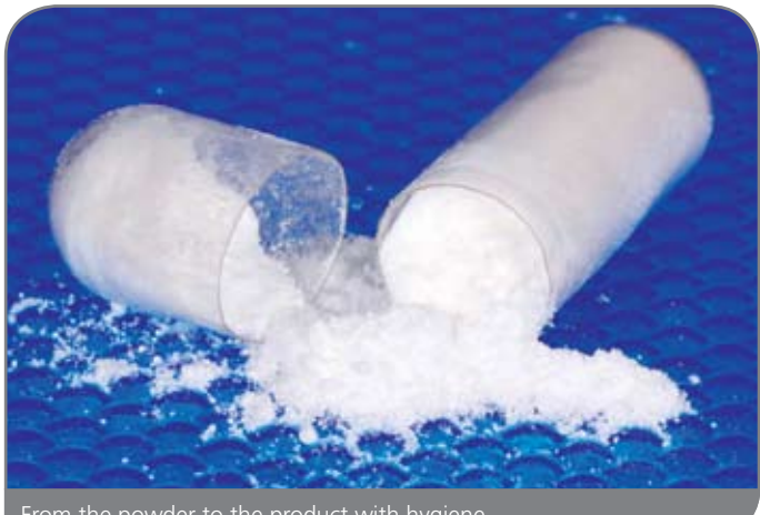
From the powder to the product with hygien