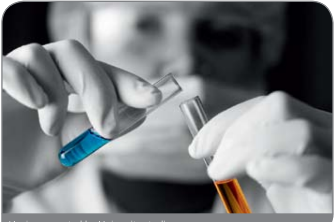
Hygiene granted by University studies

Some of the conveyors models are specifically designed for feeding encapsulating machines with empty caps of varying format without damaging them and above all prevent them from breaking as they are conveyed. The parts of the conveyors that contact the products are made of AISI 316L steel while the structural parts are made of satin-finished AISI 304 steel. This means that they can be fully washed and sterilized while contributing towards compliance with the GMP standards governing the chemical-pharmaceutical sector.