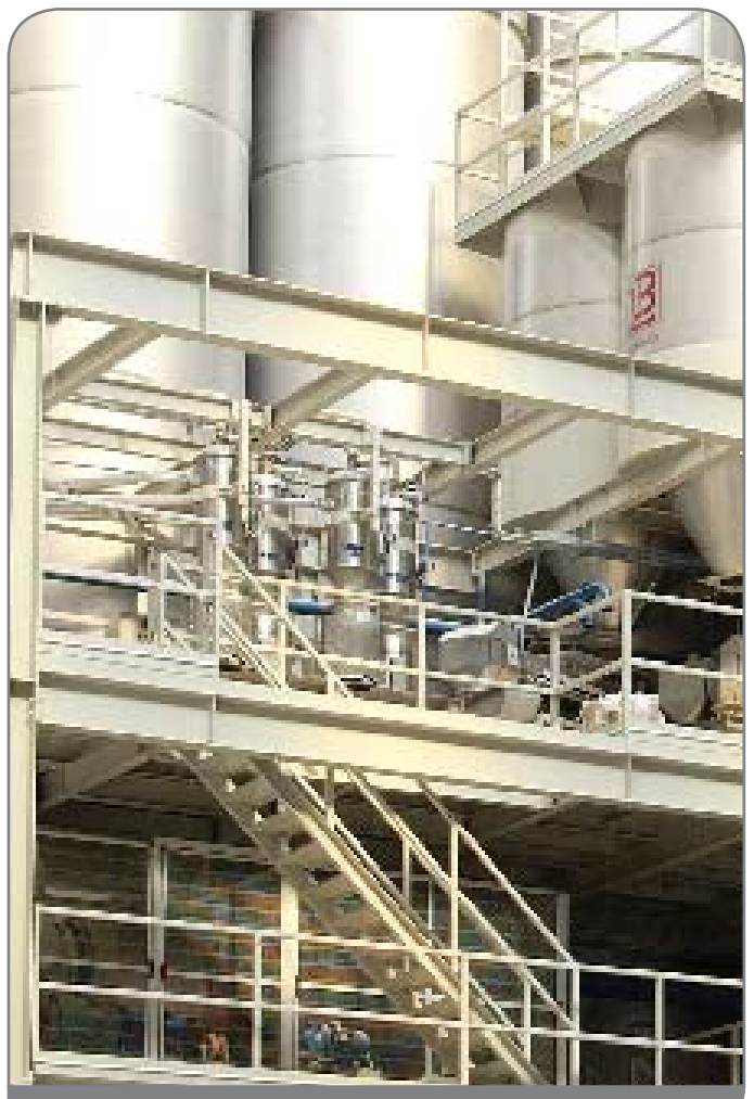
Feeding of installations

When it comes to ceramic tiles, pneumatic conveyors are widely used in the production process by companies who have made automation a major strategy. Pneumatic conveyors are used throughout the production phase for: