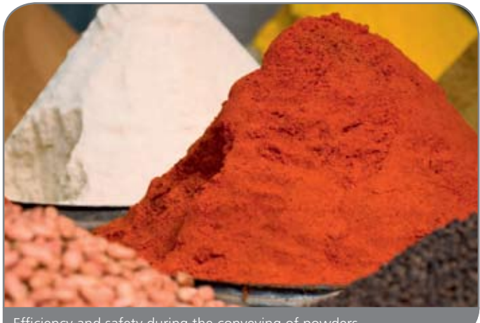
Efficiency and safety during the conveying of powders