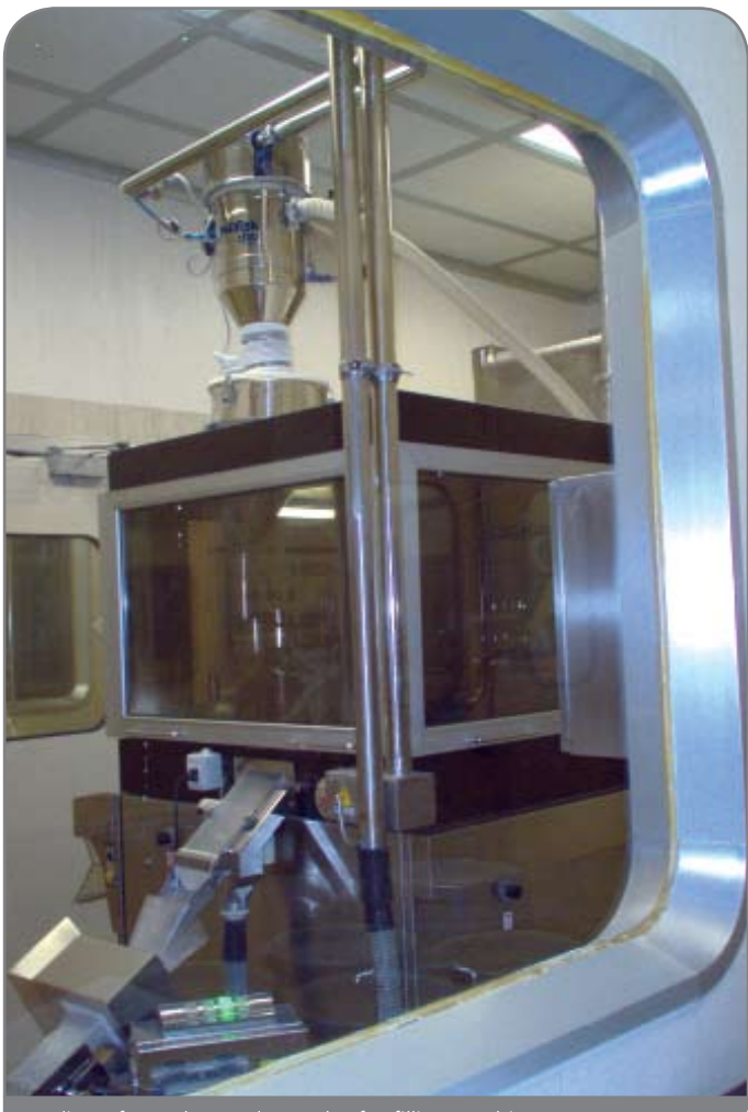
Feeding of powders and capsules for filling machine