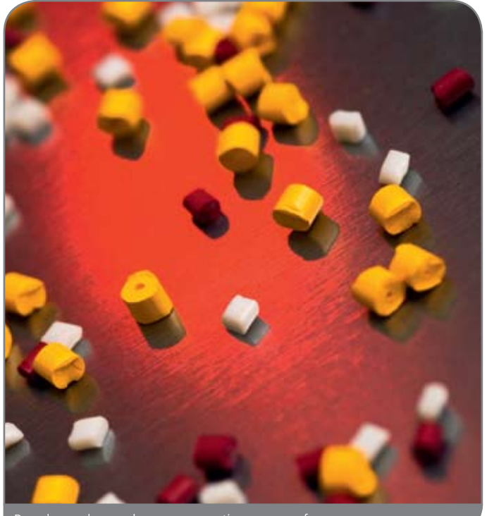
Powder and granules: a pneumatic conveyor for many uses