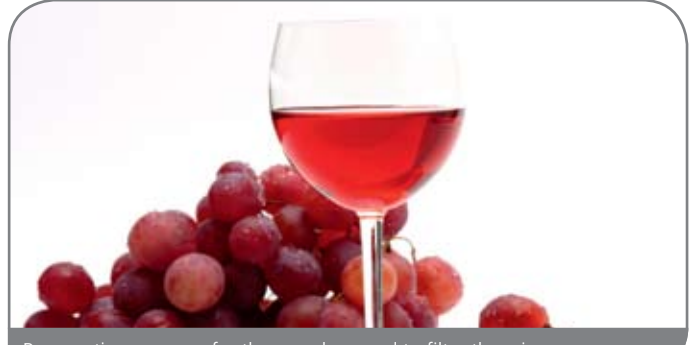
Pneumatic conveyors for the powders used to filter the wine

For roasting products, Nilfisk-CFM's pneumatic conveying system replaces the conventional conveying systems which uses belts, elevators, screws and so forth. Moreover it also prevents the products from being damaged and guarantees that they are treated in a hygienic way.